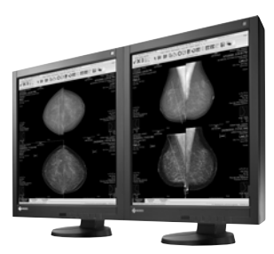
RadiForce GX530 is Elizabeth Wende's monitor of choice.

easier on the user. It's integrated front sensor allows for self-calibration, while a presence sensor can help reduce energy consumption by detecting when a user is in front of the monitor. It will enter power save mode when no one is present and then resumes normal operation once the user returns.